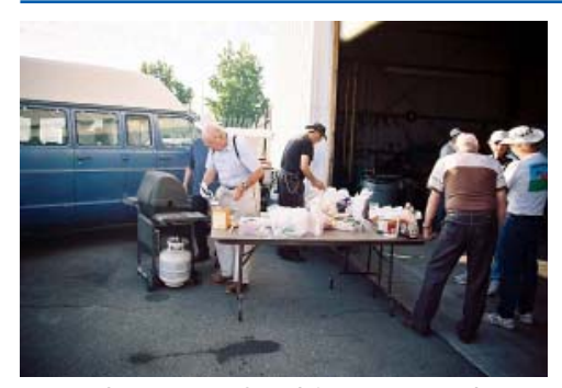
The great food is prepared