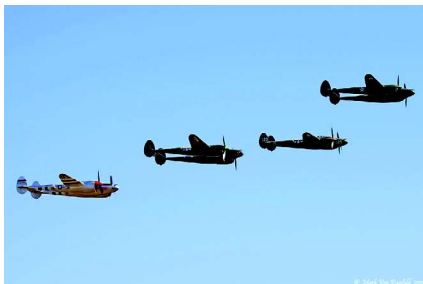
All Four P-38s

departed for home. The B-2 was followed by a U.S. Coast Guard C-130 Hercules from Sacramento which made one pass.