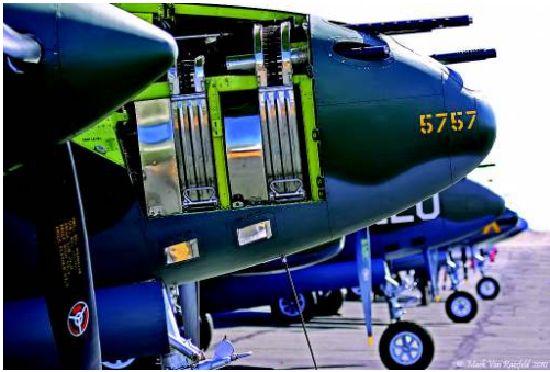
P-38's business end