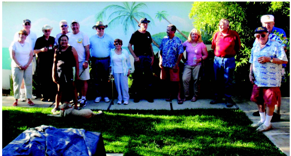
Some of the partygoers