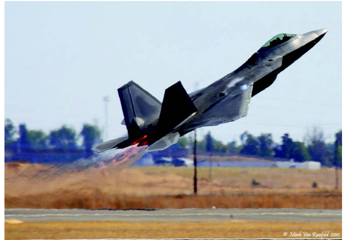
F-22 with Afterburner

I think the biggest draw for this show were the Lockheed P-38 Lightnings. All four flew towards at the end of the show. There were a number of tents set up near the P-38s for several P-38 pilots who