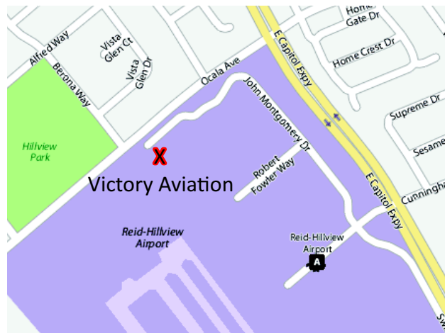
VICTORY AVIATION 2502 John Montgomery Drive

EAA Chapter 62 meets at Victory Aviation the first Thursday of the month, except in August, when we meet on the second Thursday. Everyone welcome.