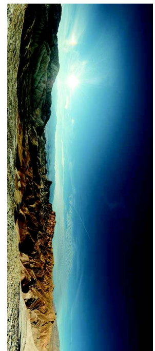
Gratuitous sideways photo of Zabriskie Point

For next month I expect to write an exhaustive article about our Fly-Out to Death Valley, but that will depend on our ability to corral some pilots to take us there.