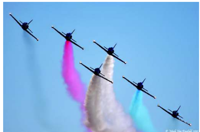
Fry's with color