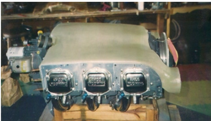
"Go-fast" plenum mounted on an IO-540