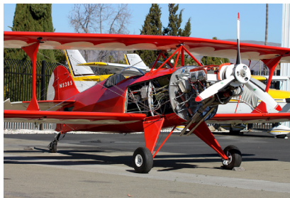
The latest creation

EAA Chapter 62's April meeting will be held at the RHV Terminal Building