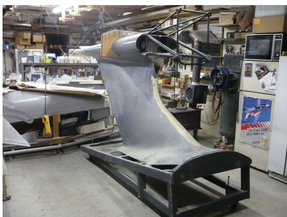
Where the engine's headed