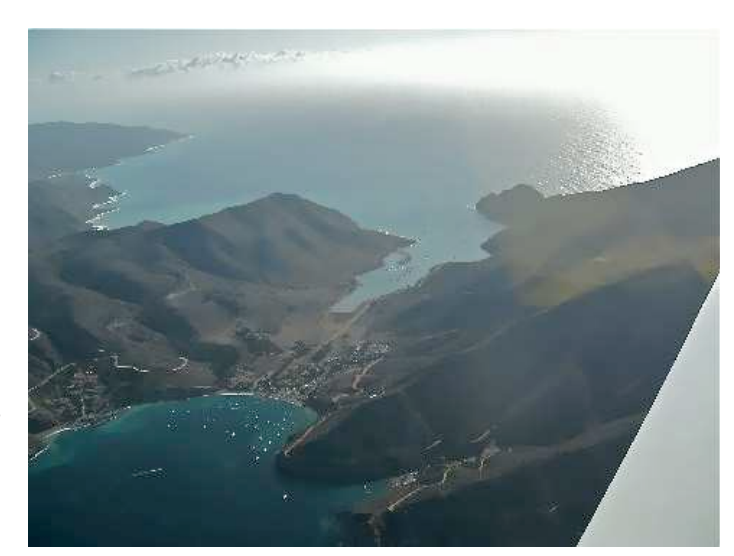
Catalina from the air

rented electric bikes to explore the town. Given the perfect weather and temperatures in the 70s year round, it was fresh and gorgeous. Cars are highly restricted on the island. With golf carts everywhere on the narrow streets and the Mediterranean architecture, it seemed to me like I was in the land of Lilliputians. It was a wonderful escape and worthy of another go. Next time, I plan to visit Two Harbors, a town to the northwest and a pair of harbors that straddle a narrow isthmus.