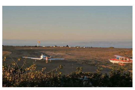
Steve with Terry in his Glasair

threshold difficult to see until passing it. Knowing that the runway was only 3250 feet long with sharp drop-offs at both ends resulted in a "carrier landing" with sharp braking to prevent overshoot-