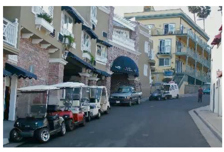
Avalon street scene good place for a Smart Car