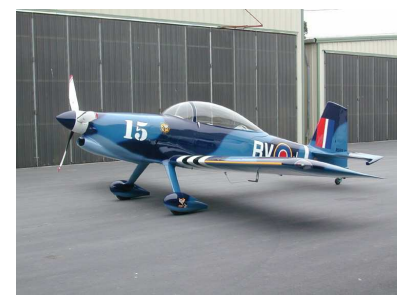
Rotary Powered RV