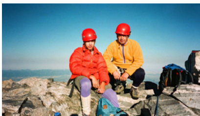
Still on top of Grand Teton