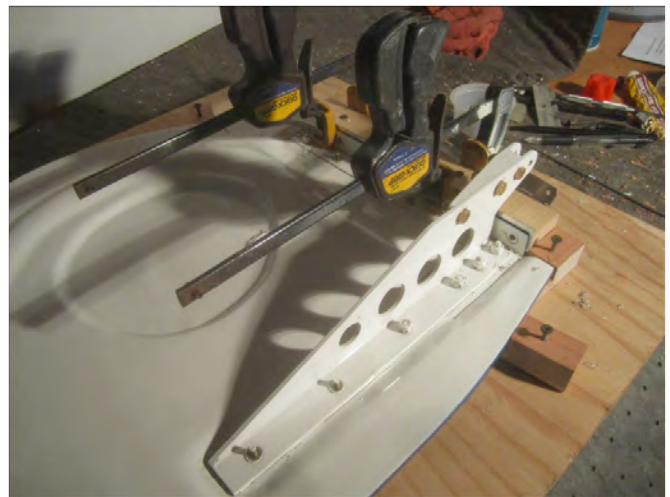
Drilling a template after putting the gear door in the jig. The old hinge can now be removed without moving the gear door or the template

After flying for a couple of years, a couple of friends commented on how much the gear doors would vibrate – on the ground or during run-up. I checked the doors and hinges and they seemed OK. I asked another friend about his door