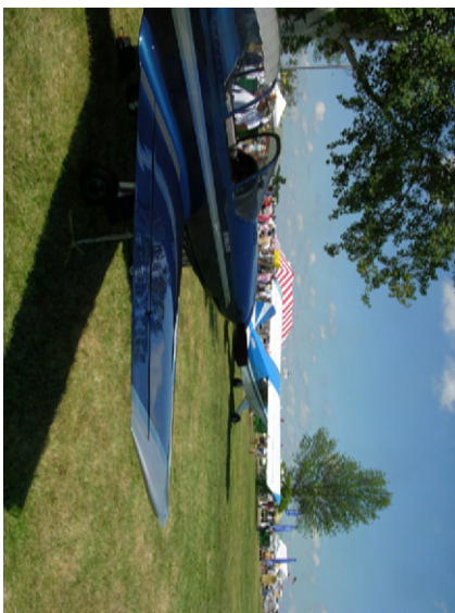
gratuitous Falco photo