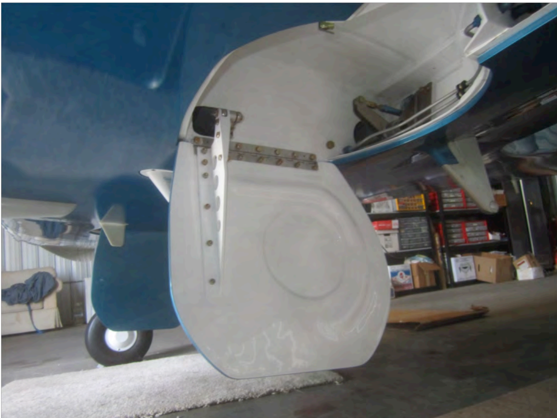
Yes, all back together...