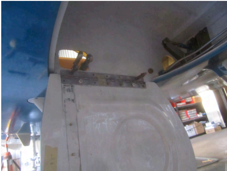
Test fitting the gear door...