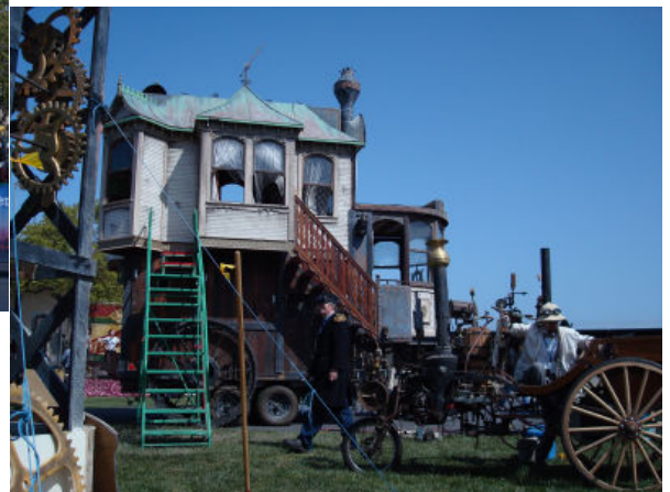
Makers Fair - Eclectic Stuff