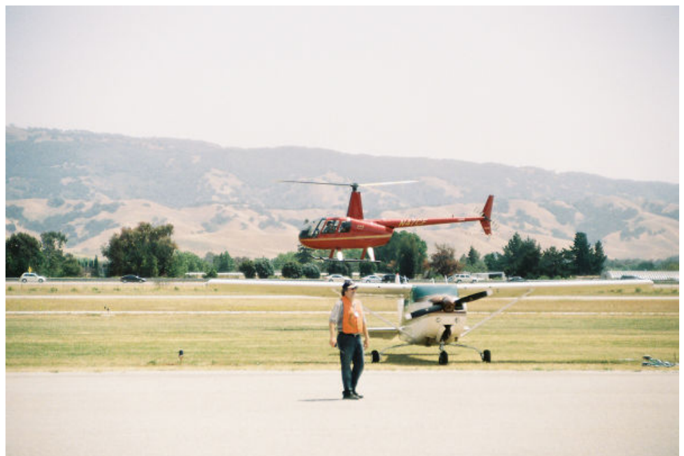
Helicopter Young Eagles flights