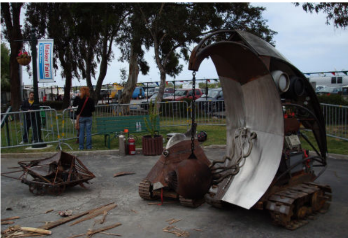
Makers Fair - More eclectic stuff