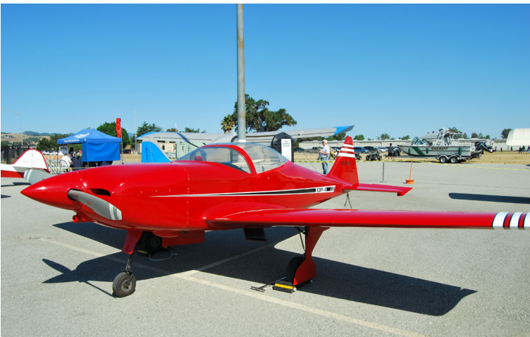
GP-4 at South County