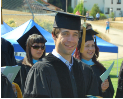
Not your editor