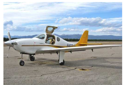
Lancair Evolution Lycoming powered