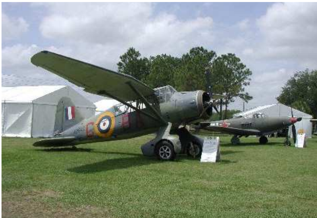
Westland Lysander to the left Bell P-39 Airacobra in Soviet markings on the right Seminar tents in the background