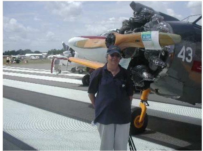
"I love radial engines"

how long it took me to set up the tent. Well, with the threat of rain, I'm sure I broke a record and the tent was up and I was in it in less than 10 minutes. A few minutes later, there was a shower which, fortunately, did not last long. After a short walk from my tent site, I located an area where a band comprised of the visiting pilots was playing great music and a vendor was cooking up roasted corn on the cob, selling beer and sodas. What a great dinner I had and in the camaraderie of aviation folks.