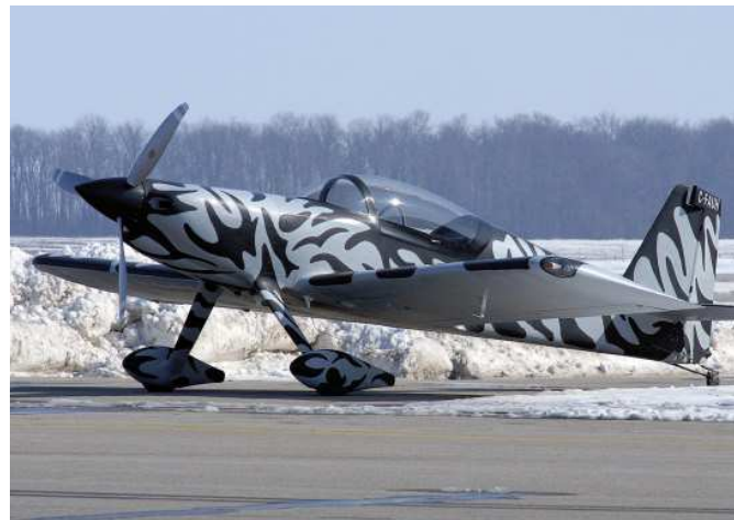
Wild paint on an F-1 Rocket

Sport Aviation magazine has taken on a new look. How do you like it? By now many of you may have received an email from EAA asking you for your comments. The magazine is mailed to my husband, a long time EAA member, but since I'm the one that brings in the mail, I scan through it before he has a chance to ask, "What mail did I get today?" I just have to make sure to remember not to dog-ear any of the pages or he will know I've read through it. Most wives hide the incoming bills from their husbands, but as a pilot and active EAA member, I look forward to getting my hands on 'our' Sport Aviation magazine before he sees it even if it has his name on it.