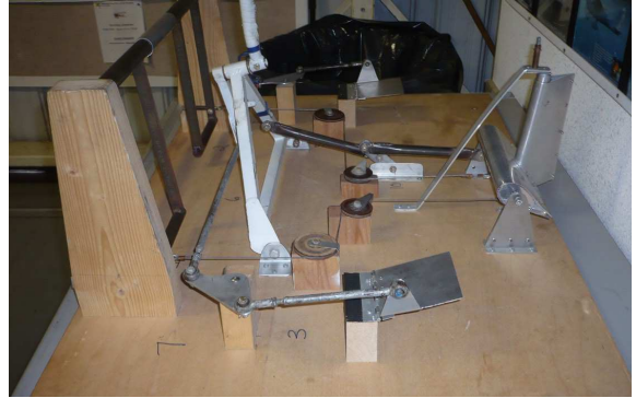
Contraption to show common flaws in Control Linkage