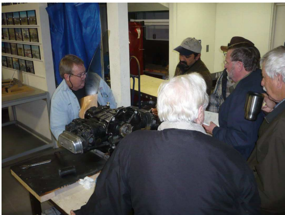
Compression Check Technique

Various bits of airplane pieces were passed around and the students were challenged to find the cracks & flaws and enter the results in their workbooks.