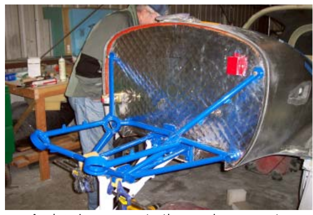
Andy's Legacy gets the engine mount.