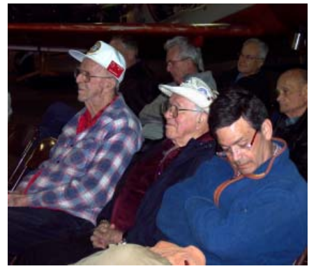
The crowd is taking notes.