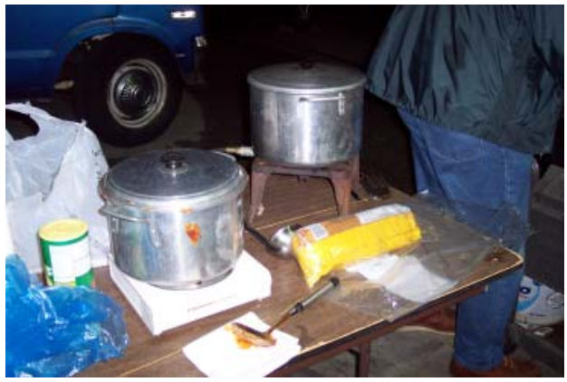
The spaghetti is cooking.