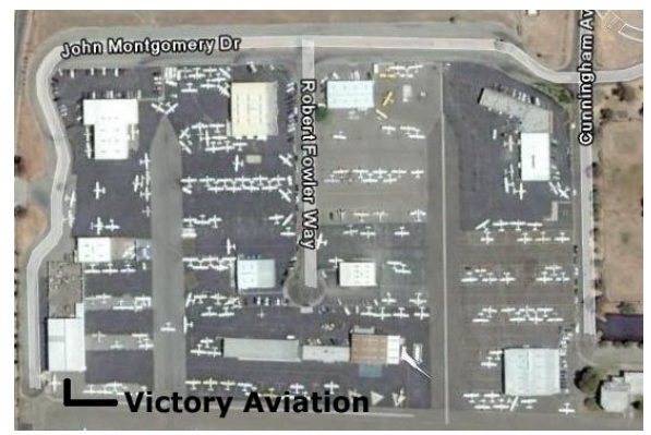
Victory Aviation 2502 John Montgomery Drive San Jose, CA 95148