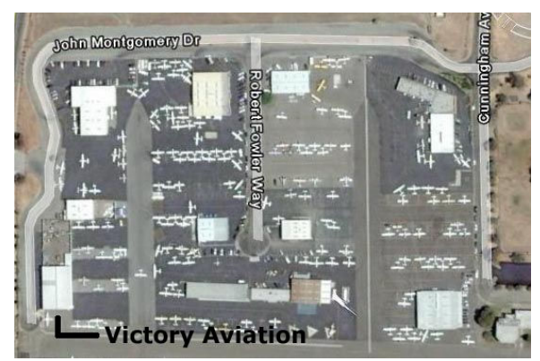
Victory Aviation 2502 John Montgomery Drive San Jose, CA 95148