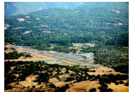
Columbia Airport from above

Airport Closure: Noon to 3 PM, Saturday and Sunday