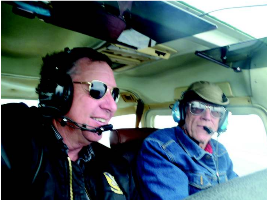
On the Way to Harris Ranch