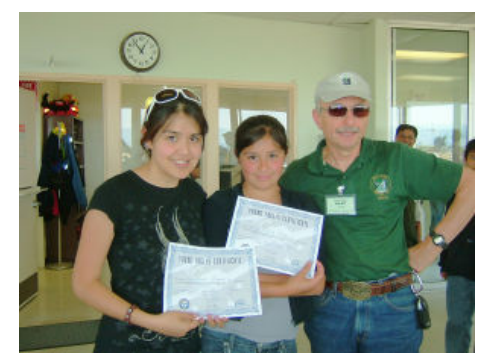
Successful flight and now its official with certificates.