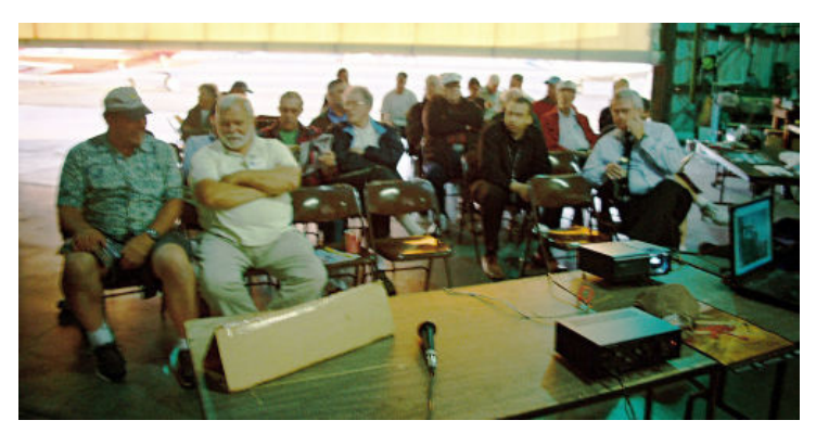
The friendly crowd