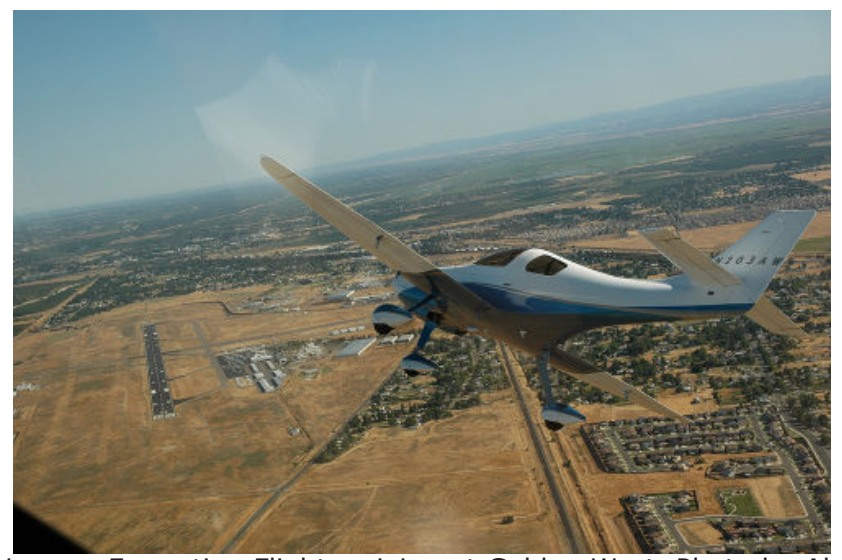
Legacy Formation Flight arriving at Golden West.

One last note, the County Airport study, scheduled for June 24, has been delayed to Aug 12.