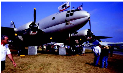
Curtiss C-46 Watsonville, 2001

EAA Chapter 62's February meeting will be held at the RHV Terminal Building