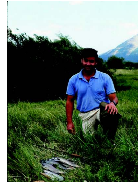
no recent photo for me