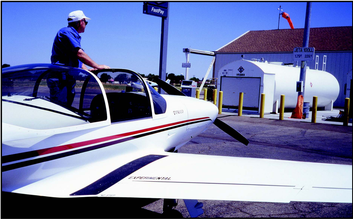
Archival Falco fueling - 2001 avgas is $2.29