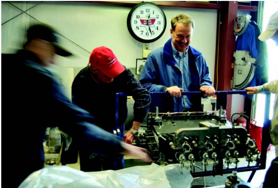
A happy man in his shop