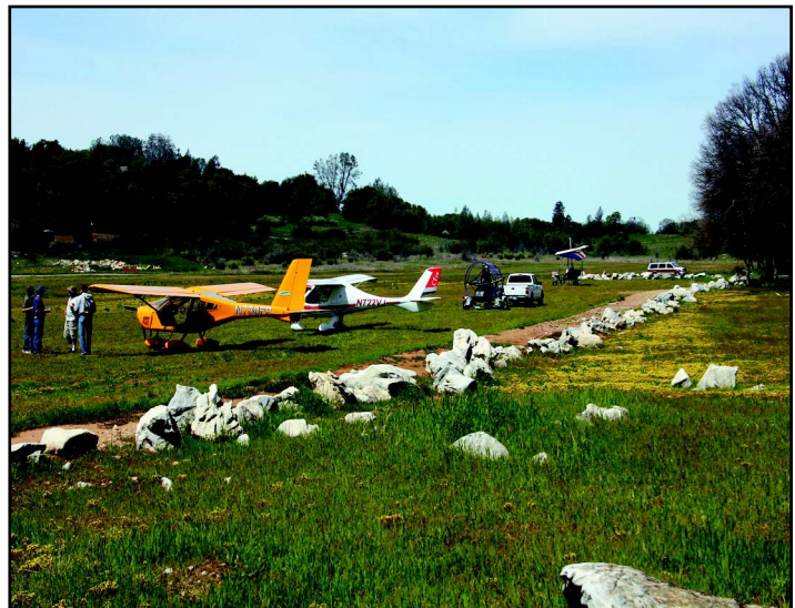
Grass strip at Columbia