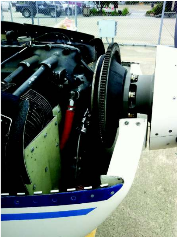
close inspection shows the alternator repair