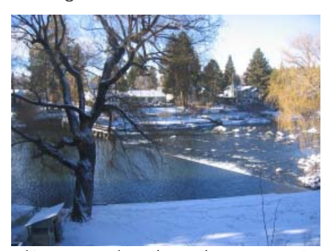
It was a nice day when we got there...

On a more personal note, Sam and I spent a week at Lancair in December, doing basic assembly on the new (old) Legacy kit. We got there just as the cold weather started (snow in Seattle and Portland? Yup). Everyday was a test to see if we could get to the factory over the icy roads. We came back on Dec 16 towing the fuselage and wings. More ice and snow, chewing up tire chains. I have no plans to do this again, but if we do, next time it will be in the summer! By the way, the Garmin 496 works great on the road too, along with XM weather for when you're driving.