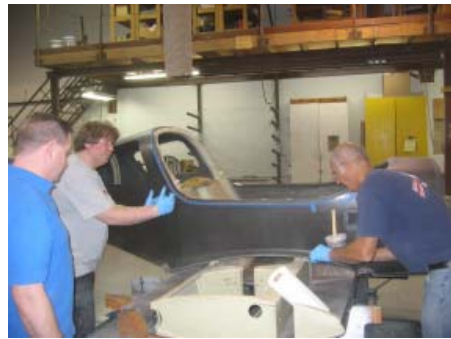
Attaching the fuselage to the center wing.