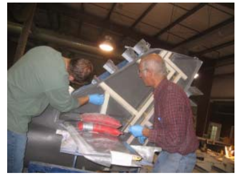
Closing out the tail.